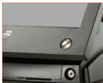
J2 950 Button